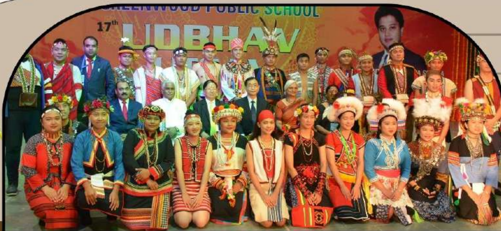
H.E.MR.BAUSHUAN GER - AMBASSADOR OF THE TAIWAN WITH THEIR OWN NATIONAL GROUP